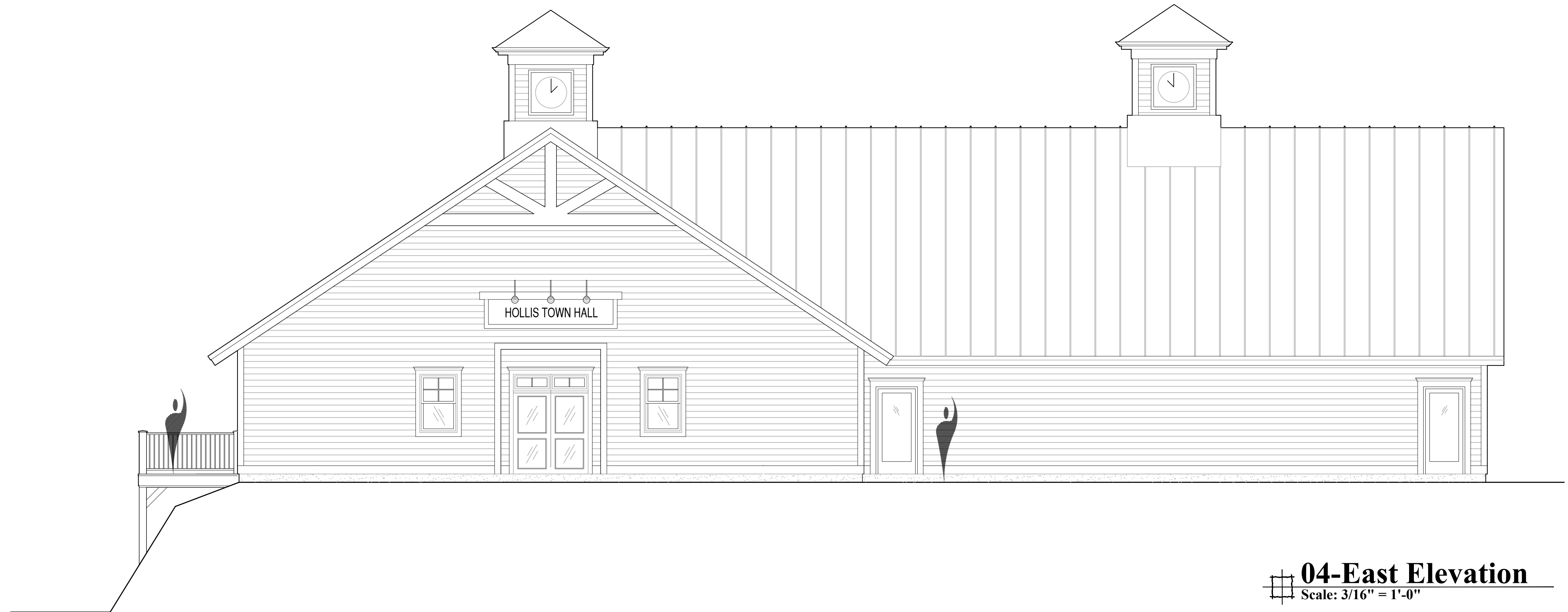
04-East Elevation Scale: 3/16" = 1'-0"