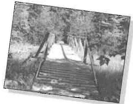
This bridge was built on California Field by a local horse riding group