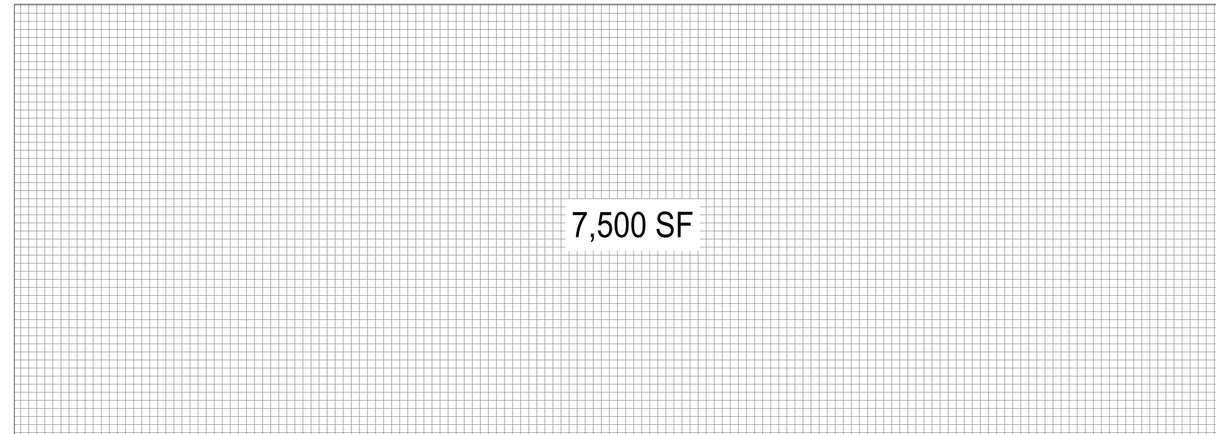
KEY PLAN Scale: NTS