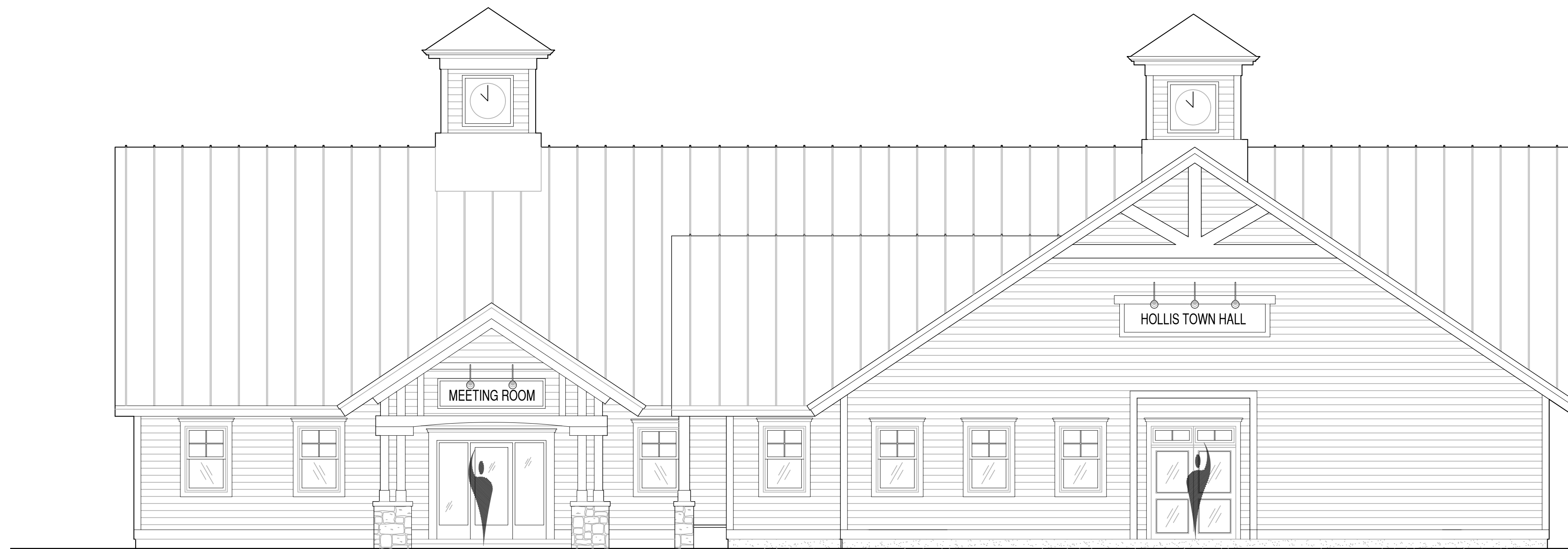
# 02-West Elevation Scale: 3/16" = 1'-0"