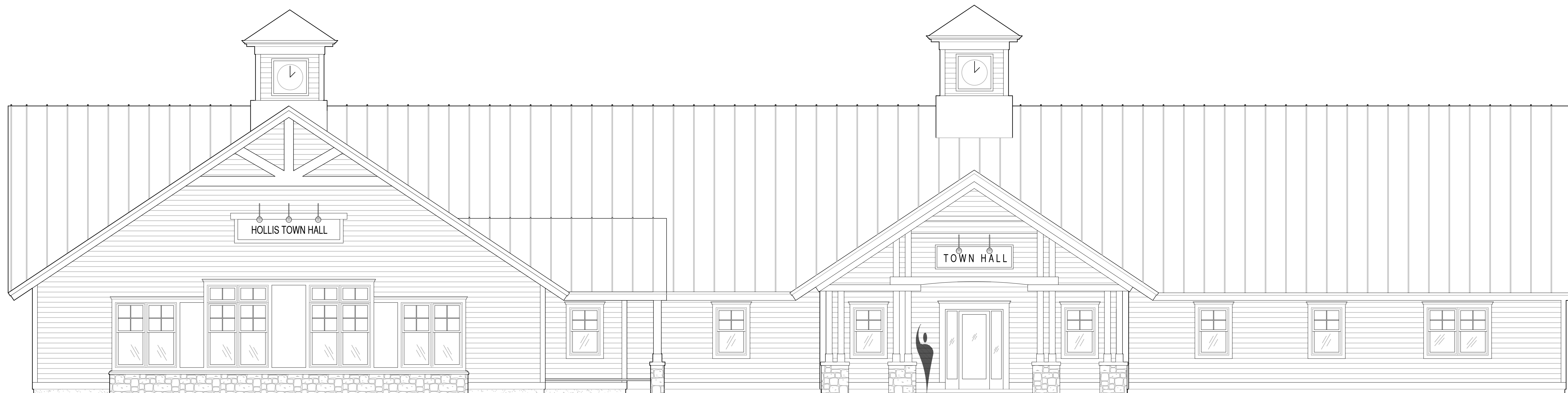
# 01-North Elevation Scale: 3/16" = 1'-0"